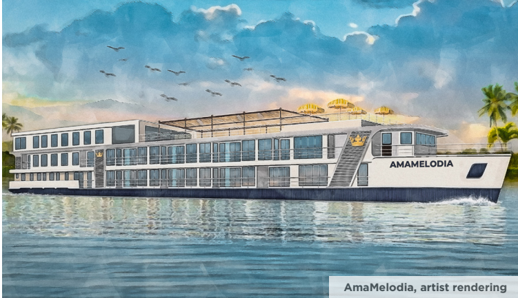
AmaMelodia, artist rendering

October 18-25, 2025 | 7-night river cruise | aboard AmaMelodia