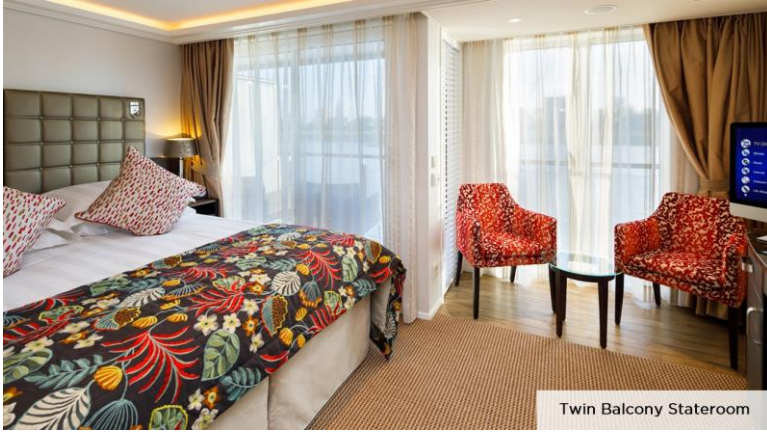
Twin Balcony Stateroom

7-night cruise – 3-night post cruise | August 21-31, 2025 | Aboard AmaKristina