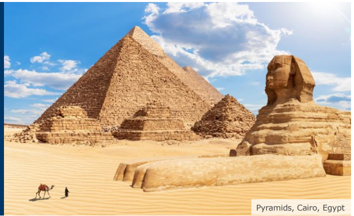
Pyramids, Cairo, Egypt

11-Night Land & Nile River Cruise Journey May 14-25, 2025