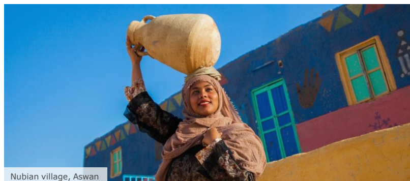
Nubian village, Aswan