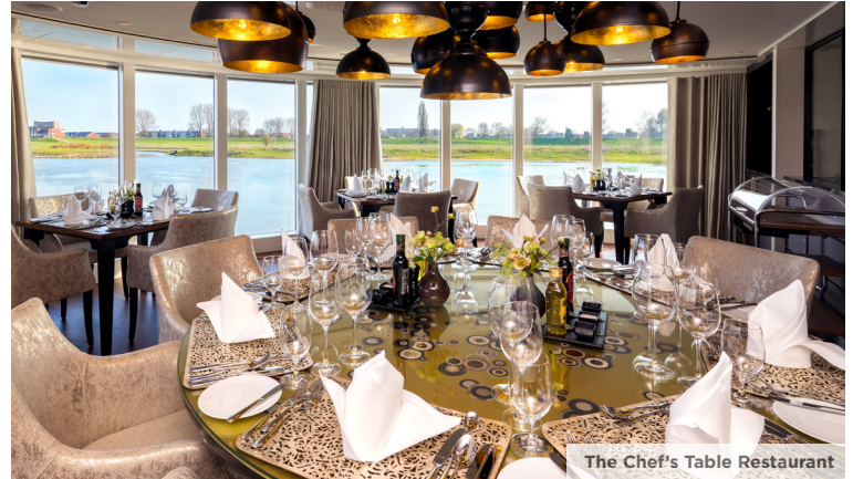
The Chef's Table Restaurant