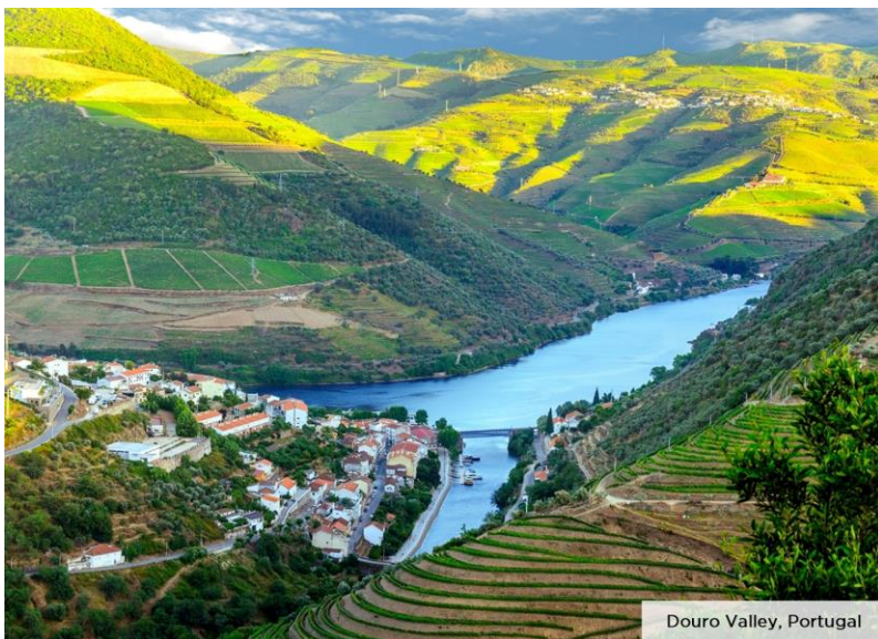
Douro Valley, Portugal

SAVE AN ADDITIONAL $1000 OFF ALREADY REDUCED PRICING COMPLIMENTARY STATEROOM UPGRADE $50 SHIPBOARD CREDIT PER PERSON OR COMPLIMENTARY LAND