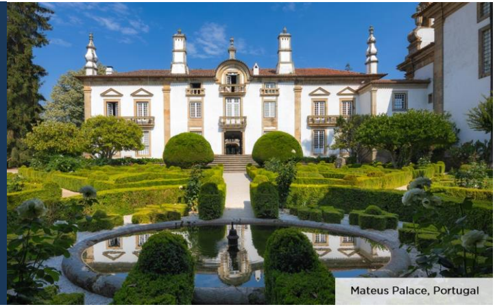
Mateus Palace, Portugal

7-night cruise from Vila Nova de Gaia (Porto) to Vega de Terrón August 22-29, 2026 | AmaVida