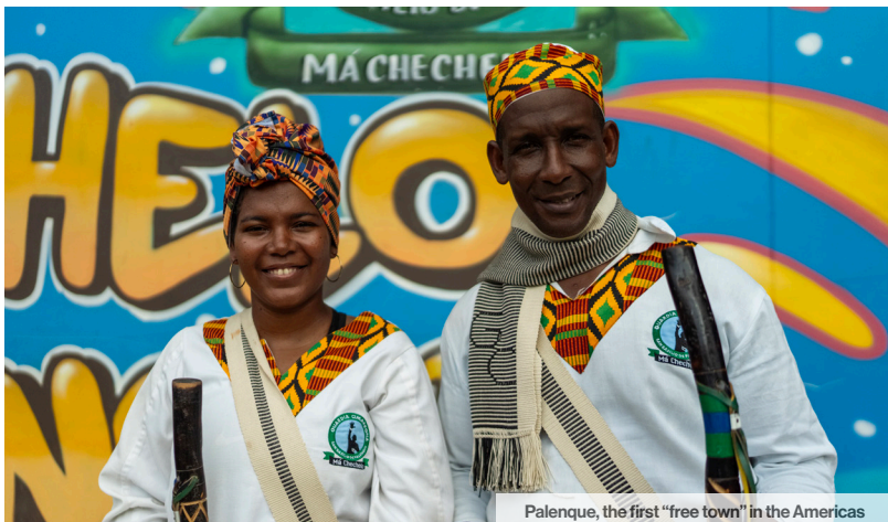
Palenque, the first "free town" in the Americas